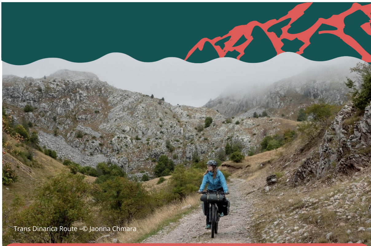
Trans Dinarica Route