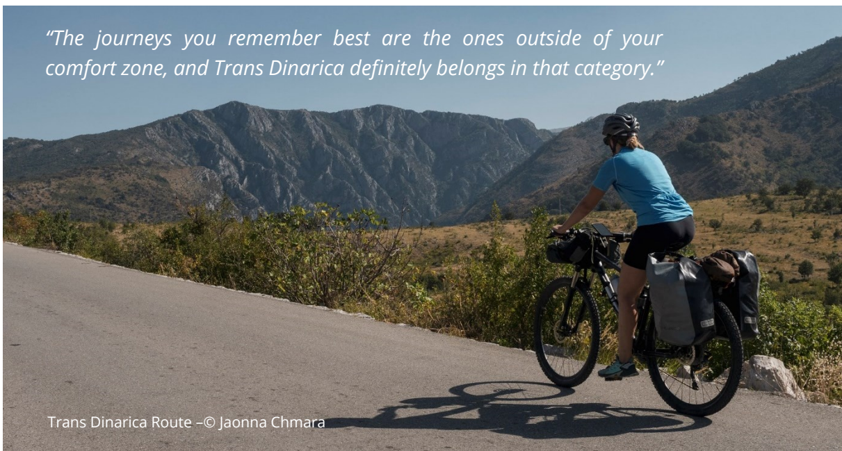
Trans Dinarica Route

"The journeys you remember best are the ones outside of your comfort zone, and Trans Dinarica definitely belongs in that category."